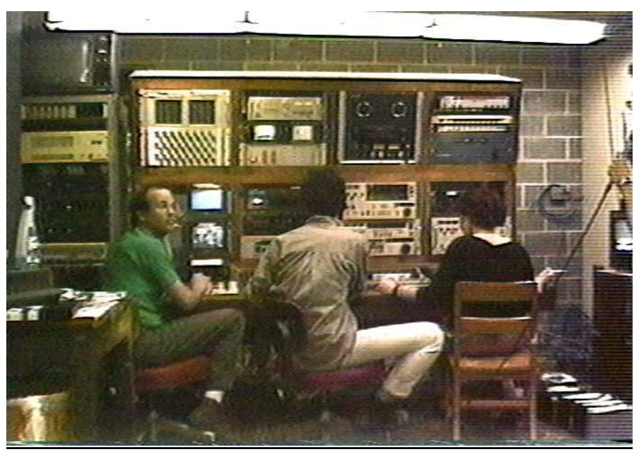
Intermedia Studio Iowa